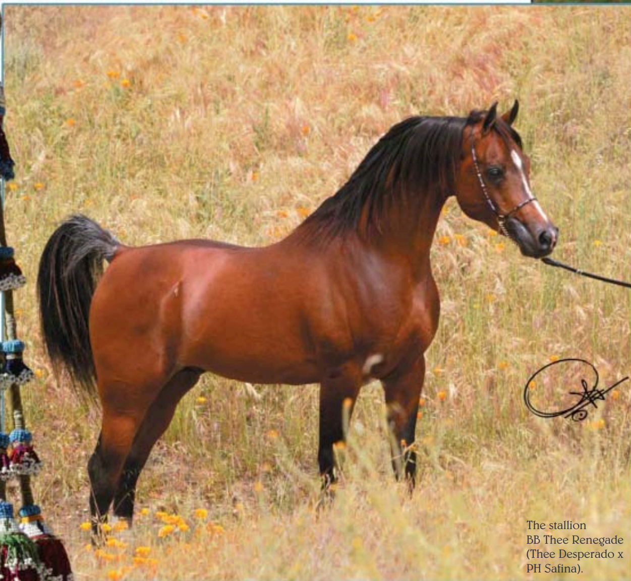
The stallion BB Thee Renegade (Thee Desperado x PH Safina).

have to look very far into an Arabian horse's ancestry to see the name of a straight Egyptian.