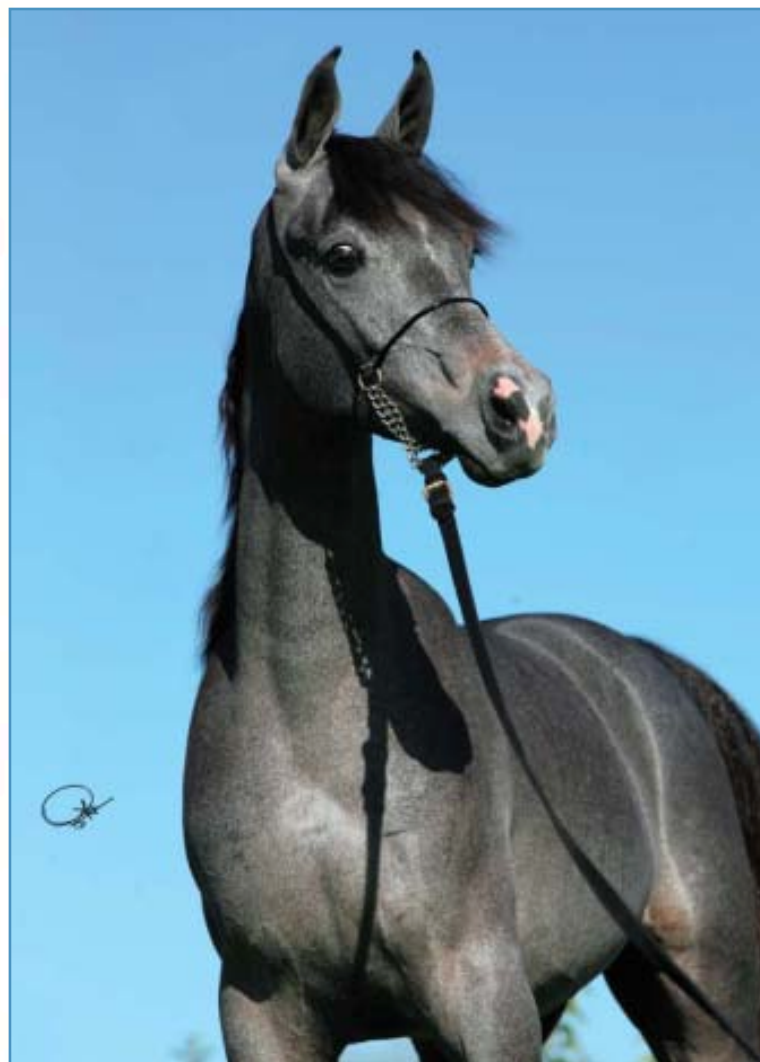
Facing Page: The stallion Ali Saroukh (Ruminaja Ali x Glorietasayonaara),

The number of straight Egyptians has never been large, and today they represent only about two to four percent of the total Arabian horse population worldwide. Yet their influence is readily apparent. One does not