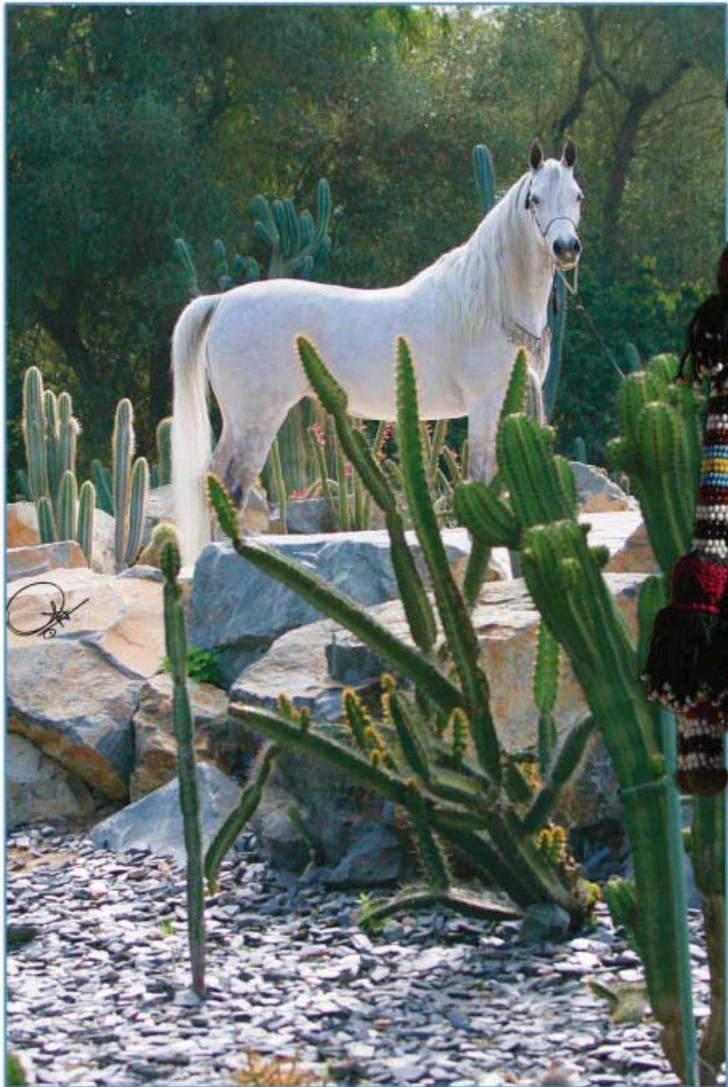
Above: Shaboura (PVA Kariim x Sahbine), photographed at Lotusland in Montecito, California.