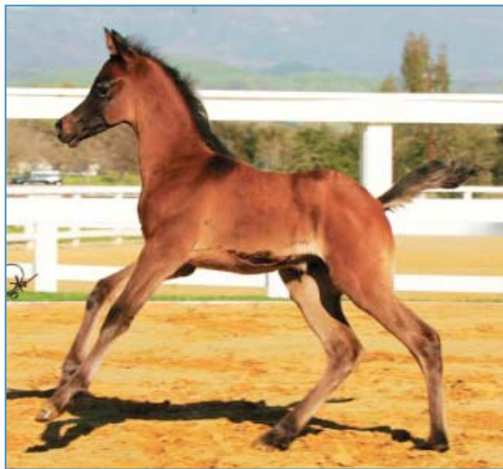
Above: Rebel Rose SMF (BB Thee Renegade x Royal Laleekha) and her 2005 filly by Majestic Noble SMF, pictured at left.