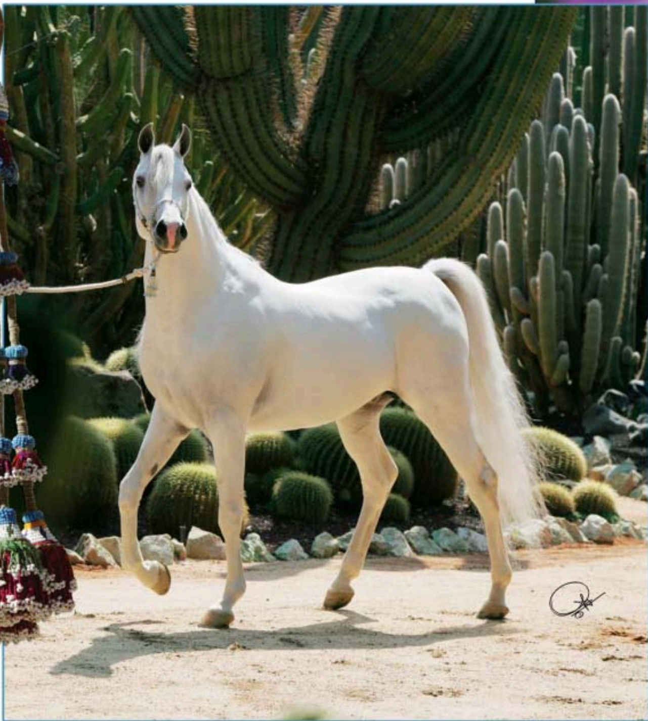
Above: The stallion Majestic Noble SMF (Marquis I x Nagda), pictured at Lotusland in Montecito, California.

“The strains that originated from the horses of the tribes of the Arabian desert were preserved through selective breeding.”