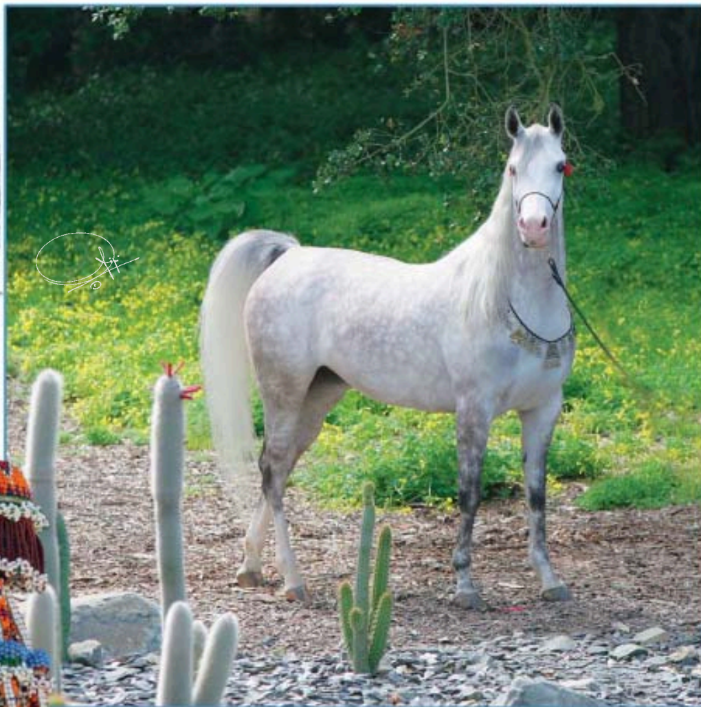
Left: The mare Jade Lotus SMF (Ali Saroukh x Imdals Jade), photographed at Lotusland.