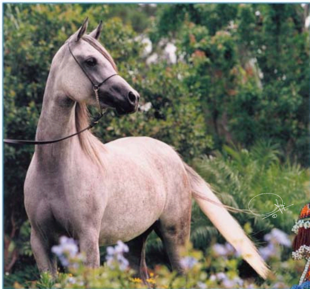
Right: The mare *Jasmine IASB (Imperial Imdal x Ansata Justina).

moves — from the middle of the country to the East coast, and then to the West coast — all within a span of fifteen years. Friends will come into your lives from all over the world; they will become a second family of the heart, even though not of blood” — my first reaction would have been total disbelief.