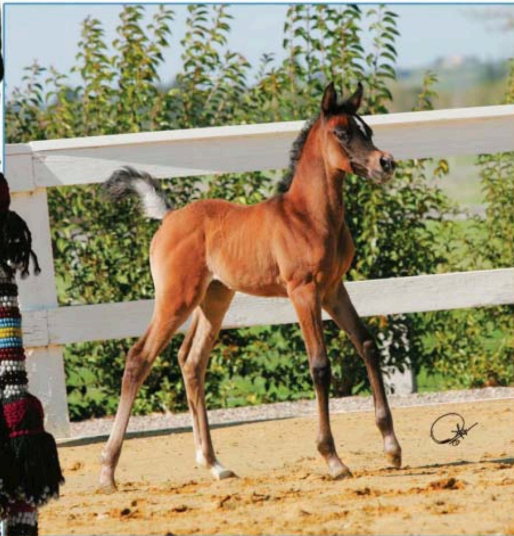
Left: A 2005 straight Egyptian filly sired by *Simeon Shai and out of Shaboura.

The fabric of our lives is one of unbelievable beauty because it is made up of relationships that are as close as a family created through our family of horses — relationships that are multicultural, global in scope and passionate about mutual goals. The common thread that binds us all together, that gives us strength and inspires our passion, dedication, and commitment is our love of this incredibly magical, mystical creature — the Arabian horse.